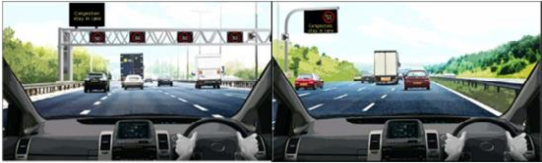
Figure 40 Smart motorway operating with VMSL