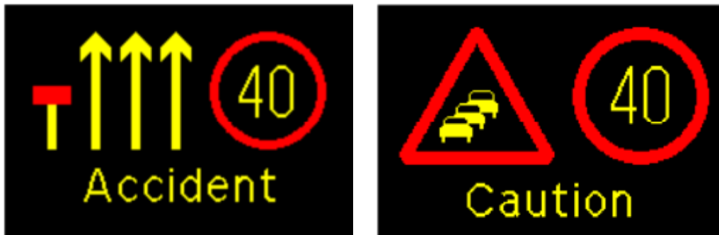
Figure 42 Typical VMS displays

9.4.3 Appropriate supporting information will be displayed on the VMS to further encourage compliant driver behaviour. Modifications to the signal control software will enable a single VMS to display three simultaneous elements: in addition to the speed restriction and supporting text legend, the sign will also be able to display either a warning pictogram (typically a 'red triangle') or lane closure 'wicket' aspect, as indicated in the examples in Figure 42.